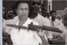
Gloria Richardson in the 1960s