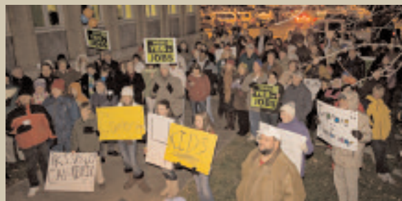
Liquor license rally Nov. 18.

The Liquor Board will vote on these proposals Dec. 1. Then the Dorchester County Council meets Dec. 2, at which point the commissioners are expected to consider the Liquor Board's recommendations. Check for the latest updates at www.cambridgemainstreet.com .