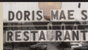
Doris Mae's has been a fixture in downtown Cambridge for 29 years.

the Thomas Funeral Home, 700 Locust St. The family will receive friends the hour before the service. Memorial contributions: Dorchester County Humane Society, P.O. Box 132, Cambridge, MD 21613.